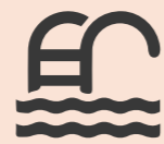
ROOF TOP POOL