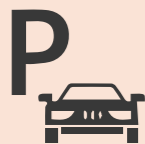
PUZZLE PARKING SYSTEM