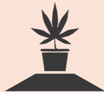
ELEGANT ENTRANCE LOBBY